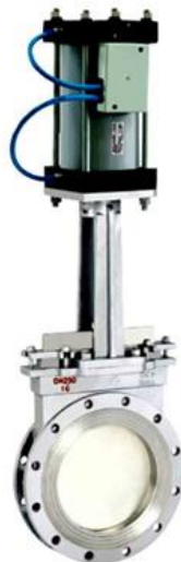
Pneumatic Knife Valve