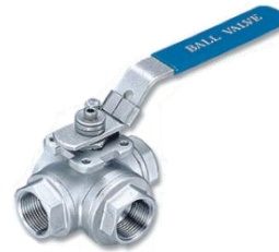
3-Ways Ball Valve