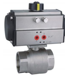
Pneumatic Ball Valve