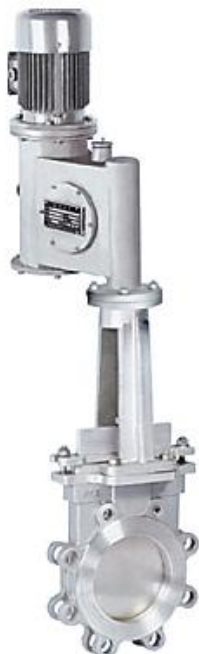
Electric Hydraulic Knife Valve