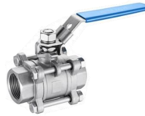
3-Pieces Ball Valve