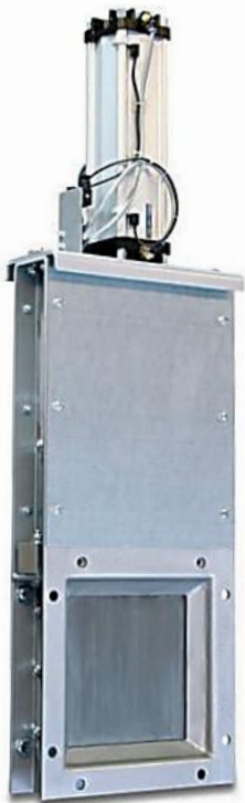
Square Port Knife Gate Valves