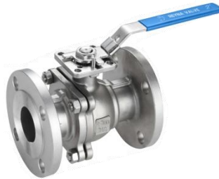
Flanged Ball Valve

Size: DN8 - DN100 (1/4" – 4") Material: Carbon Steel, Brass, Stainless Steel Working Pressure: 1000 WOG Connect End: Thread Thread Ends Types: BSPT / NPT / BSPP / PT Seat: PTFE / RPTFE Mediums: Water, Oil, Gas, Acid Applicable Temperature: -40°C ~ 300°C