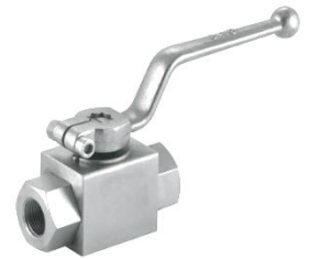
Hydraulic Ball Valve