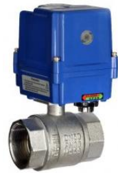
Electric Ball Valve