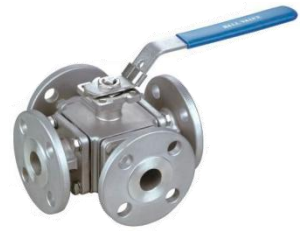
Flanged 4-Way Ball Valve