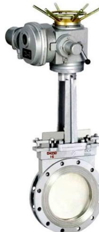
Electric Knife Valve